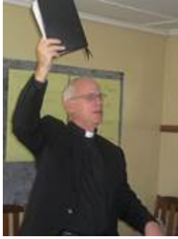
Kabwe Sunday Service

“O Lord, bless now your holy, eternal, inerrant, written Word. You have prayed, O Lord, ‘Sanctify them in Truth, Thy Word is Truth’. Use Your Holy Word to set us apart this morning to Your service and to Your glory...”