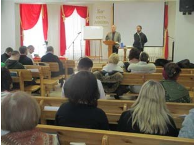
At Povlosk Baptist Church we gave the Family Discipleship Seminar. Young couples from all over the region came to hear God's Word. A new young couples Bible study was started using the FDS Workbook.