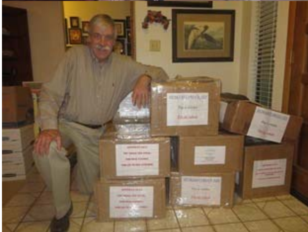
On the home front team members labor selflessly into the night to get the boxes of Bible, Bible study aids and Bible reference works ready to go.