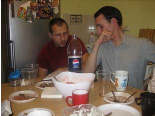
Leaders: Ask God to empower the Word as laymen mature and grow