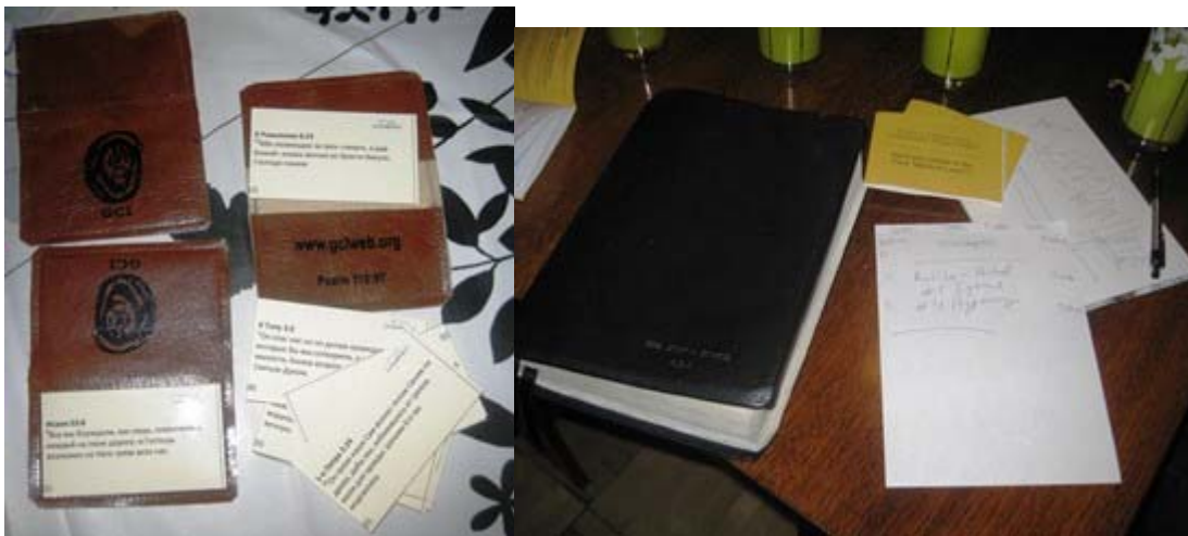
Tools - SM, Bible study, 4 Laws Pray for these tools, Scripture memory, Bible reading, Bible study and personal evangelism using the Four Spiritual Laws