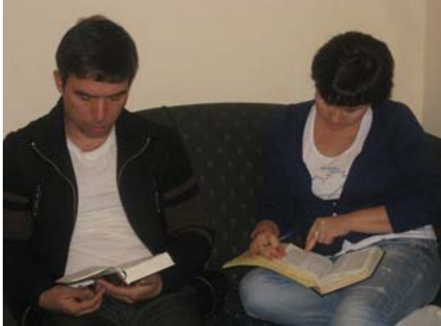
4 a,b,c Couples Petition the Lord to raise up new generations of husbands, wives and parents who will found their families on the Word of God