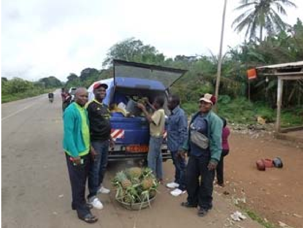
Stopping along the way for snacks