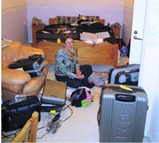
After ministering in St. Petersburg El repacks for Tyumen