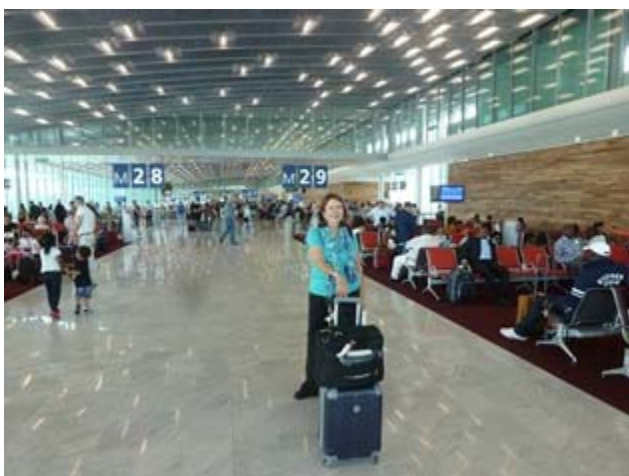
Home and then off again for Cameroon