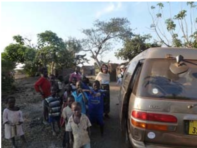
Again in Malawi and on the road again