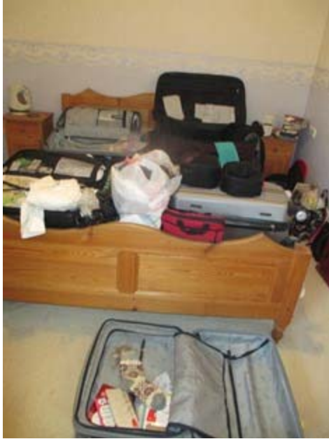
After ministering in St. Petersburg El repacks for home.