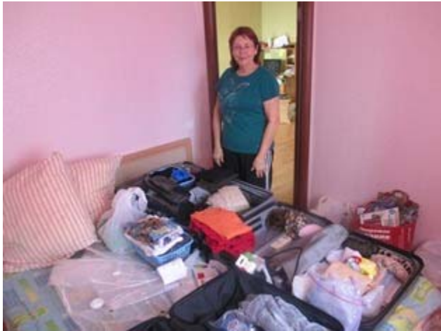
After ministering in Tyumen El repacks for St. Petersburg