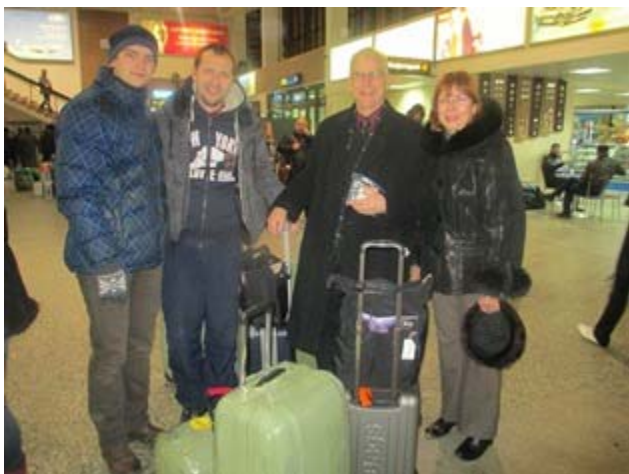
Up at 2:30 in the morning to catch the flight back to St. Petersburg