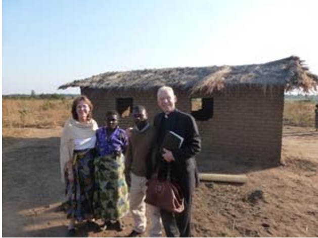
In Malawi she finds herself ministering in many differing situations