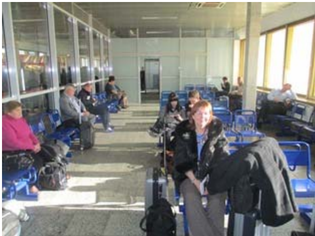
Well you get the picture, El waiting for the flight home to Houston.

She is now preparing to pack for Zambia - one year later and it starts all again