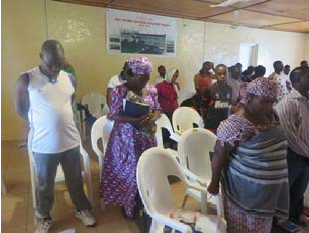
My constant prayer as I preach, "Bless now O Lord Your holy Word..."