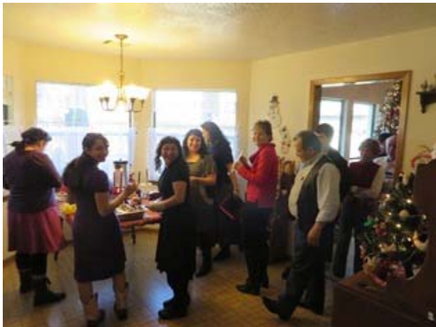
Our Class Sunday School Party