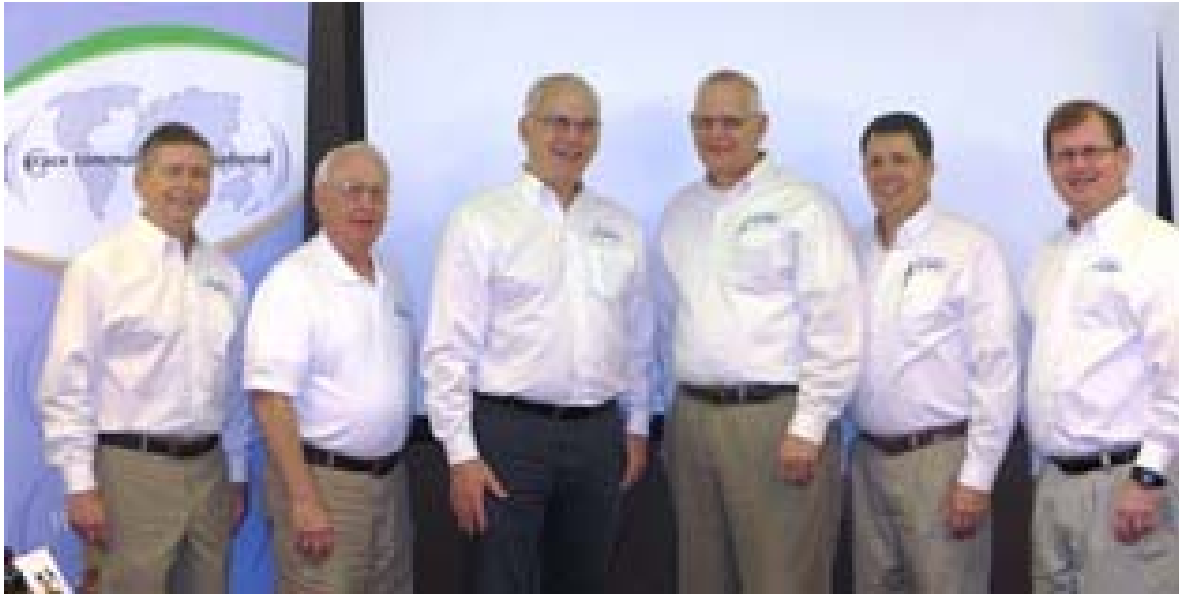
The Board of Directors

You can click on the message to be one of the many throughout the world to be blessed by the teaching of these godly men and women.