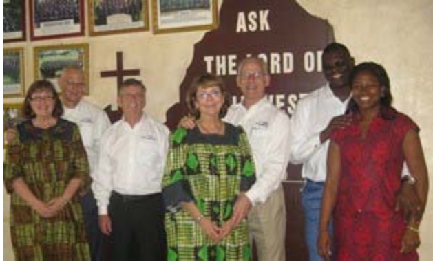
The Cameroon Team