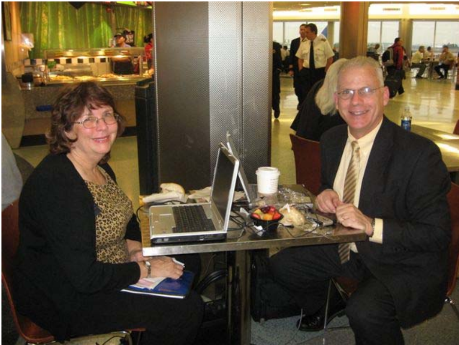
In an International Airport