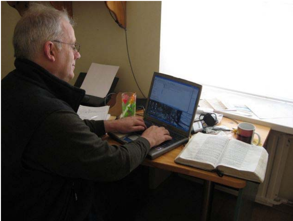
From a Makeshift Office in Russia