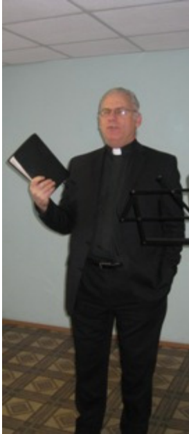
Tyumen, Russia (Siberia)