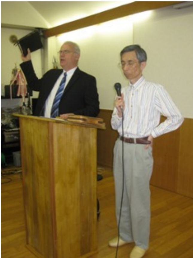
In churches in Japan