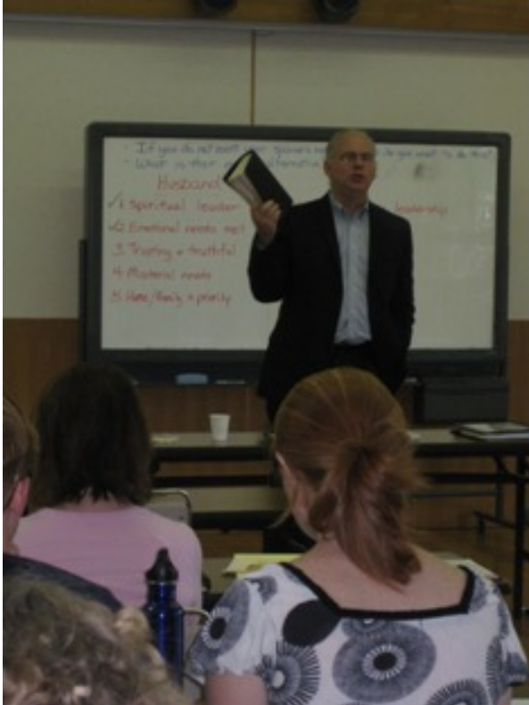
For missionaries in Japan