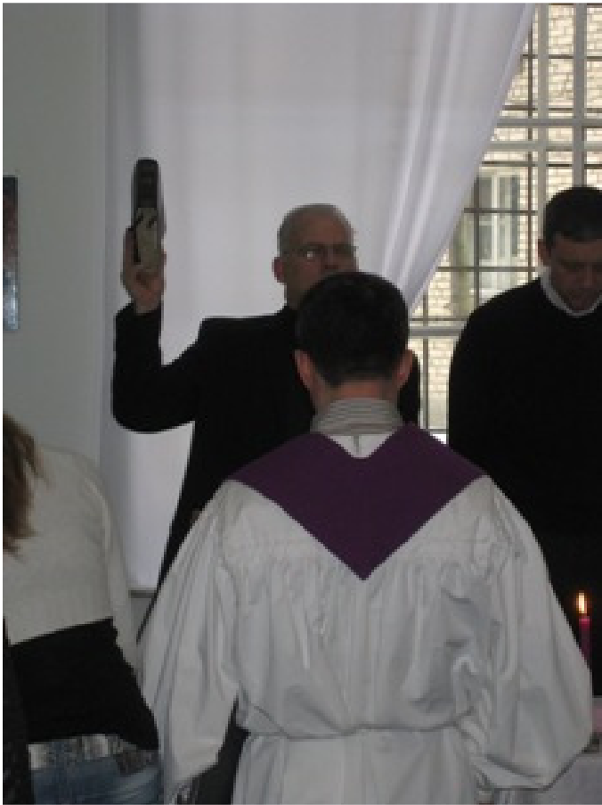
St. Petersburg, Russia