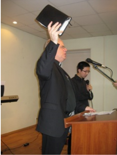
Korean Presbyterian Seminary, Russia