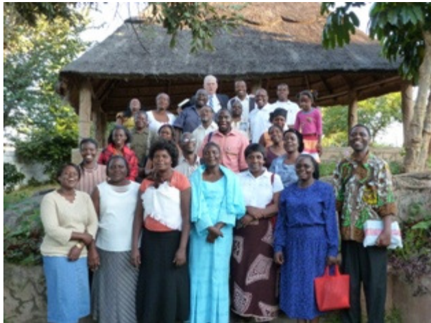
Marriage Covenant Seminar – Twin Palms Baptist Leadership

I also have a praise report. All ten boxes of Bibles, Bible study aids and Bible reference works made it into Zambia with no problem. The customs official just waived me through while all around boxes and bags were being opened, examined and emptied out. I came in with ten boxes, two suitcases of supplies and my own single bag. I praise God for your intercessory prayers which made this miracle possible. Please take a moment as you read this and Thank God for His goodness and grace.